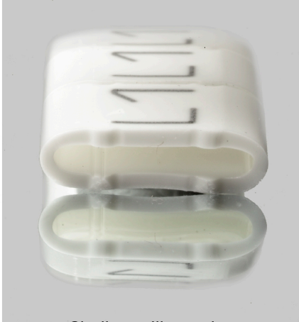
Similar to illustration