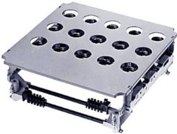
Similar to image

ASSEMBLY KIT W. DIAZED BASES 4X3X63A, F. ISO-ENCLOSURE SZ2-4 FOR SHEET STEEL ENCL. SZ.24