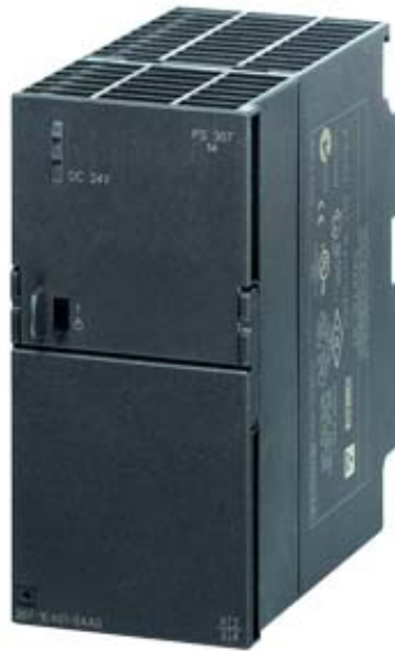
SIMATIC S7-300 STABILIZED POWER SUPPLY PS307 INPUT: 120/230 V AC OUTPUT: DC 24 V DC/5 A