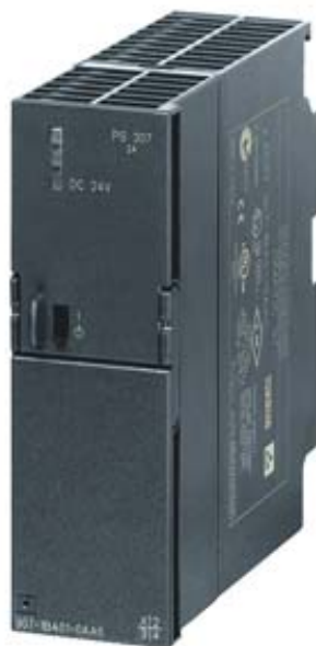
SIMATIC S7-300 STABILIZED POWER SUPPLY PS307 INPUT: 120/230 V AC OUTPUT: DC 24 V DC/2 A