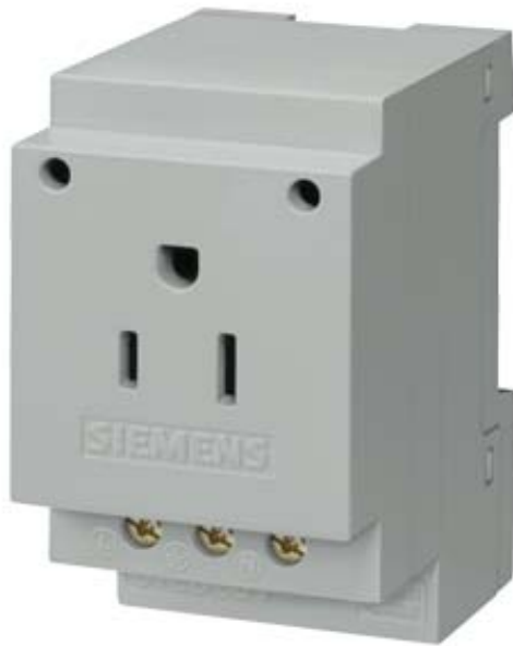
SCHUKO SOCKET 16A ACC. TO IEC 60083, UL VERSION TYPE NEMA,F.INST.IN DIST-BOARDS