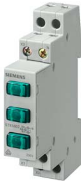
PHASE SIGNALL., D=70MM 3LAMPS 230V 3 X GREEN