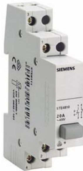
PUSHBUTTON, D=70MM 1NC/1NO 20A, 1BUTTON GREY WITH CAP RED AND GREEN