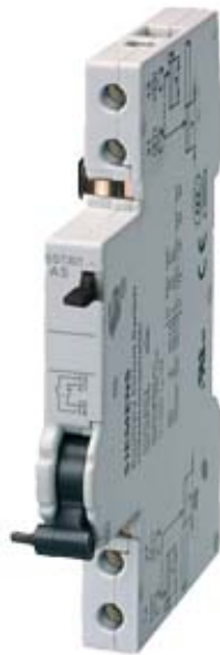
AUXILIARY CIRCUIT SWITCH 2NC, FOR MCB WITH TEST BUTTON