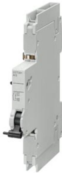
AUXILIARY CIRCUIT SWITCH 1NO+1NC, FOR MCB ACC.UL489