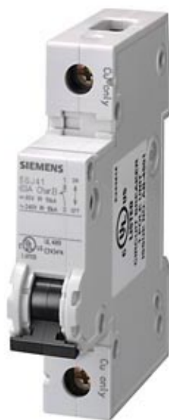
CIRCUIT BREAKER 240V 14KA, 1-POLE, C, 25A, D=70MM ACC. TO UL 489, SAME POLARITY