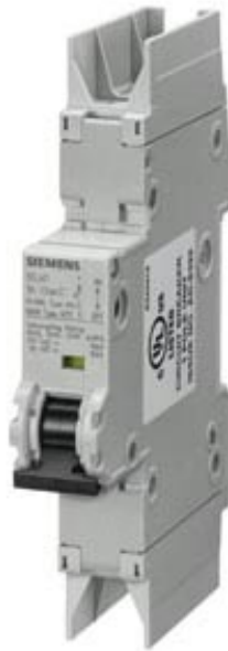
CIRCUIT BREAKER 10KA, 1POLE, D, 4A ACC. TO UL 489 - 277V