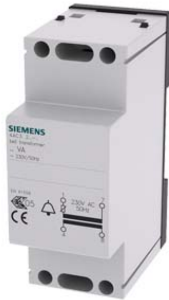
BELL TRANSFORMER, 8VA PRIM 230-240V AC,50HZ, SEK 8V,12V AC WITH PTC PROT.,2MW