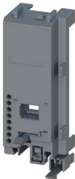
CONTACTOR BASE, FOR CONTACTOR SIZE S00 W.SCREW/SPRING- LOADED CONNECTION SINGLE-UNIT PACKING