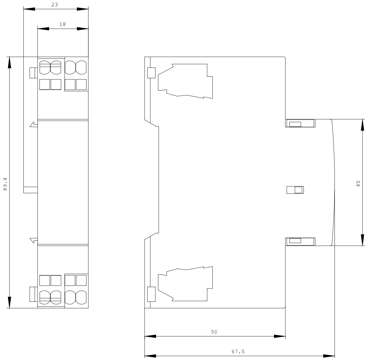
Image database (product images, 2D dimension drawings, 3D models, device circuit diagrams, ...) http://www.automation.siemens.com/bilddb/cax_en.aspx?mlfb=3RV2902-2AP0

Service&Support (Manuals, Certificates, Characteristics, FAQs,...) http://support.automation.siemens.com/WW/view/en/3RV2902-2AP0/all