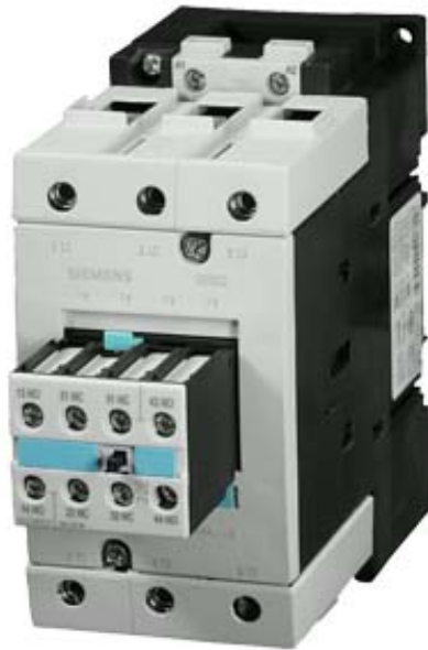
CONTACTOR, AC-3 45 KW/400 V, AC 42V 50/60HZ, 2 NO + 2 NC, 3-POLE, SIZE S3, SCREW CONNECTION