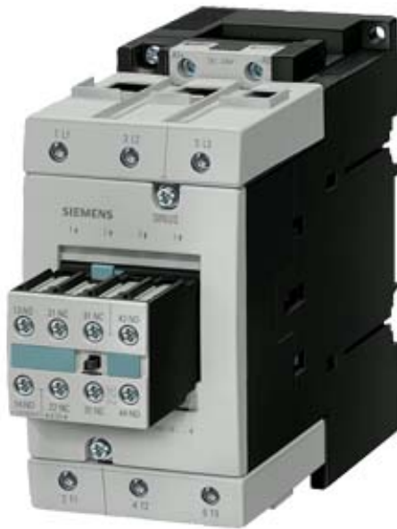
CONTACTOR, AC-3 45 KW/400 V, AC 24 V, 50 HZ, 2 NO + 2 NC 3-POLE, SIZE S3, SCREW CONNECTION