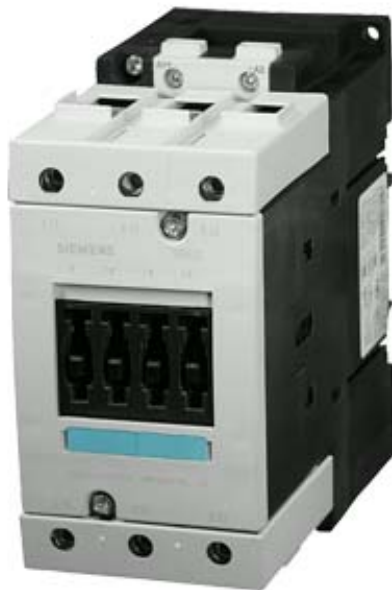
CONTACTOR, AC-3 37 KW/400 V, DC 60 V, 3-POLE, SIZE S3, SCREW CONNECTION