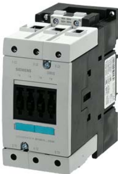
CONTACTOR, AC-3 37 KW/400 V, AC 220V 50HZ/240V 60HZ 3-POLE, SIZE S3, SCREW CONNECTION