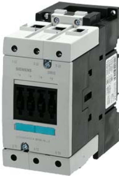
CONTACTOR, AC-3 37 KW/400 V, AC 208 V, 50/60 HZ, 3-POLE, SIZE S3, SCREW CONNECTION