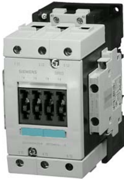
CONTACTOR, 3PH, 37 KW/400 V, 230V AC 50/60HZ,2NO+2NC LATERAL 3-POLE, SIZE S3, SCREW TERMINAL