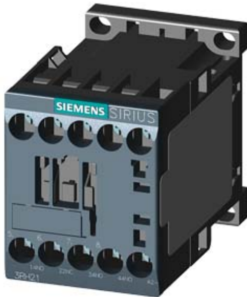
CONTACTOR RELAY, 3NO+1NC, DC 230V, SIZE S00, SCREW TERMINAL