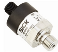
Product may differ from illustration