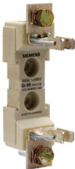
LV HRC FUSE BASE 690V(1000V) SINGLE-POLE, 160A, SIZE 00 PAD-TYPE TERMINAL, W/O SCREWS