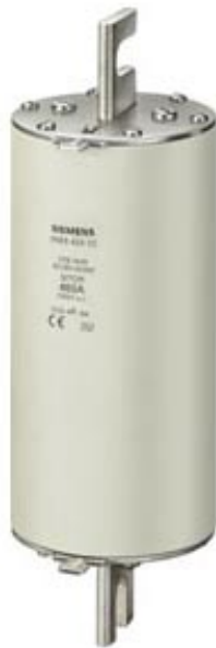
SITOR FUSE-LINK FOR SEMICONDUCTOR PROTECTION 350A AR 2000V SIZE 3 CONNECTION CONTACT INDICATOR 210MM