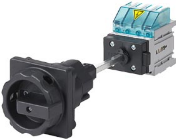
Similar to image

4-P. MAIN CTR. SWITCH IU=16, P/AC-23A AT 400V=7.5KW TO BE FITTED AD THE BASE RAILS/2-HOLE MOUNTING ROTARY ACTUATOR BLACK 4 -HOLE MOUNTING