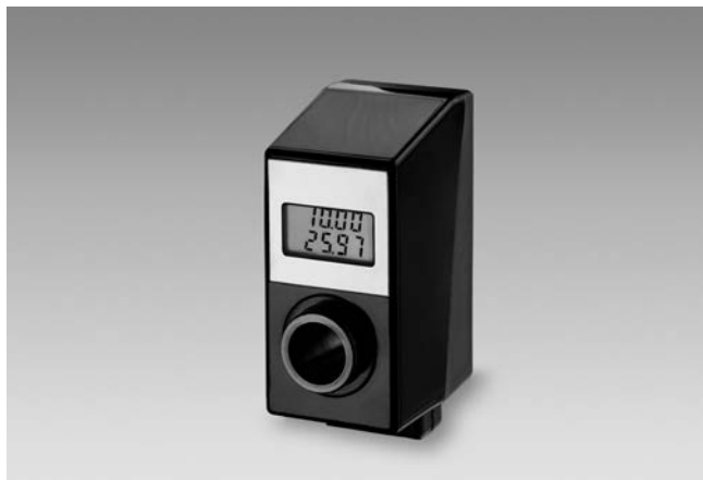
N 150 with connector output