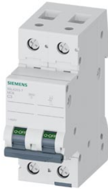
Miniature circuit breaker 400 V 10kA, 2-pole, C, 3A