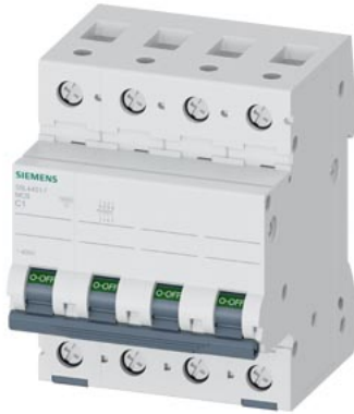
Miniature circuit breaker 400 V 10kA, 4-pole, C, 1 A