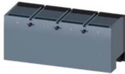
terminal cover extended 4-pole; 1 unit accessory for: 3VA15/25