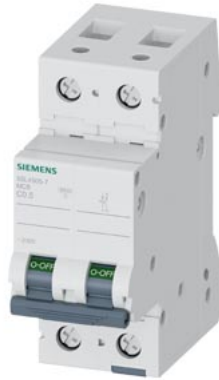
Miniature circuit breaker 230 V 10kA, 1+N-pole, C, 0.5A