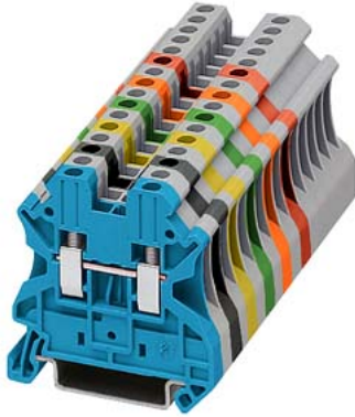
Terminal, screw terminal, through-type terminal, 2.5 mm 2 , orange