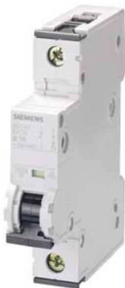
CIRCUIT BREAKER 230/400V 10KA, 1-POLE, C, 16A, D=70MM