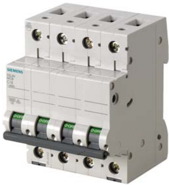
CIRCUIT BREAKER 400V 6KA, 3+N-POLE, B, 32A